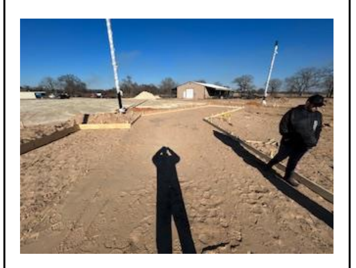
Photograph No 1