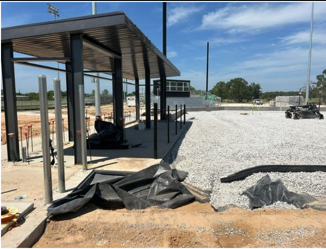
Softball view from 1 st base dugout to home