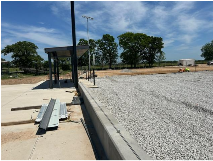
Softball 3 rd base view