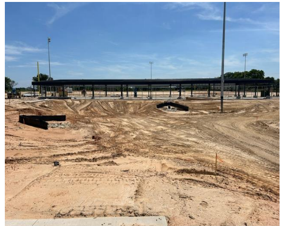
Retention with batting cage in background