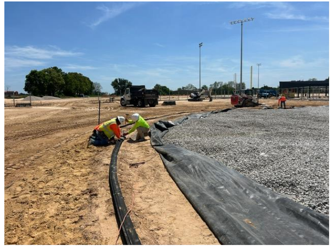
Softball edge of infield