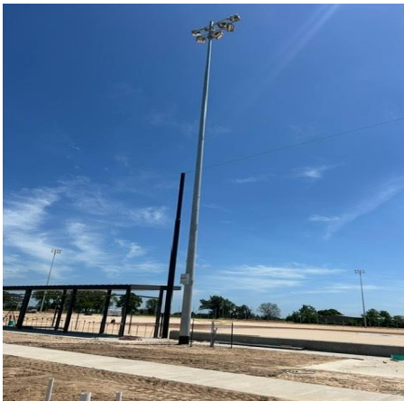
Baseball 3 rd Base dugout